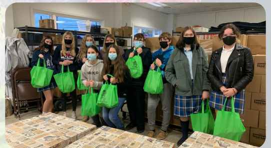
Archangel Gabriel School students donating snack packs.