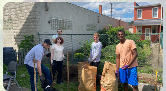
Volunteers from ServiceLink tend to the Coraopolis Community Garden.