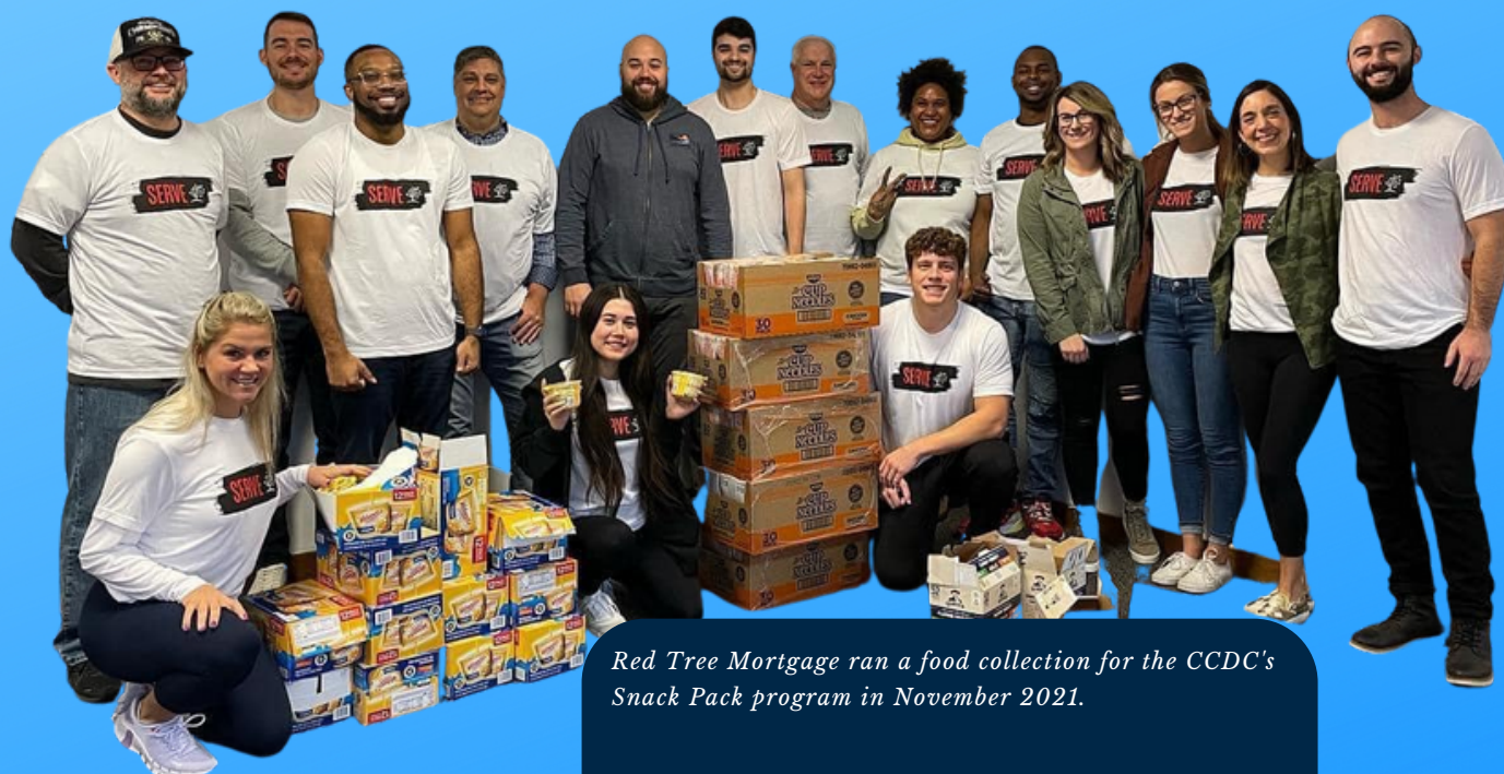
Red Tree Mortgage ran a food collection for the CCDC's Snack Pack program in November 2021.