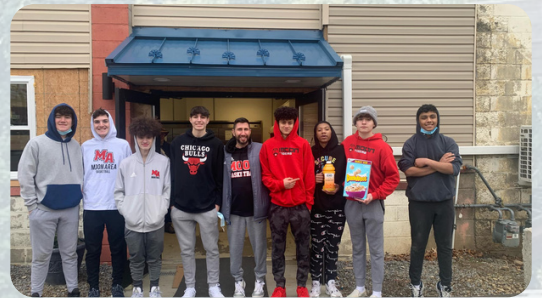
Moon Area High School Basketball team volunteered at the food pantry in November 2021.